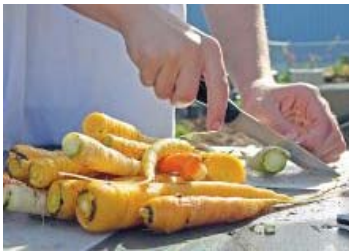
A student cuts carrots in a Sustainable Living class at Crescent Elk Middle School, where students grow and eat their own vegetables. Educators would like to extend such programs to students' homes.

Educators also want the entire community to hear the message they're imparting to students about the importance of eating healthy foods and getting plenty of exercise.